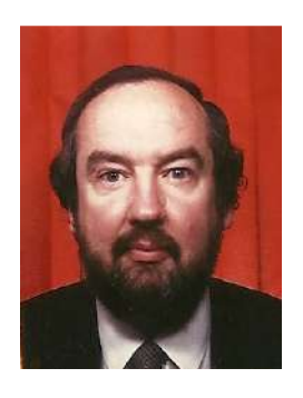
BEFORE DELIVERANCE AND HEALING

See below in the pictures BEFORE AND AFTER deliverance and healing, the visible difference made by the power of the Holy Spirit on my great day of freedom in May 1990.