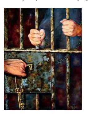
THE GATES OF HELL SHALL NOT PREVAIL

showing the "gates of brass and bars of iron" around my mind requiring the power of Jesus to shatter once and for all.