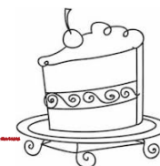
piece of cake