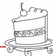
piece of cake