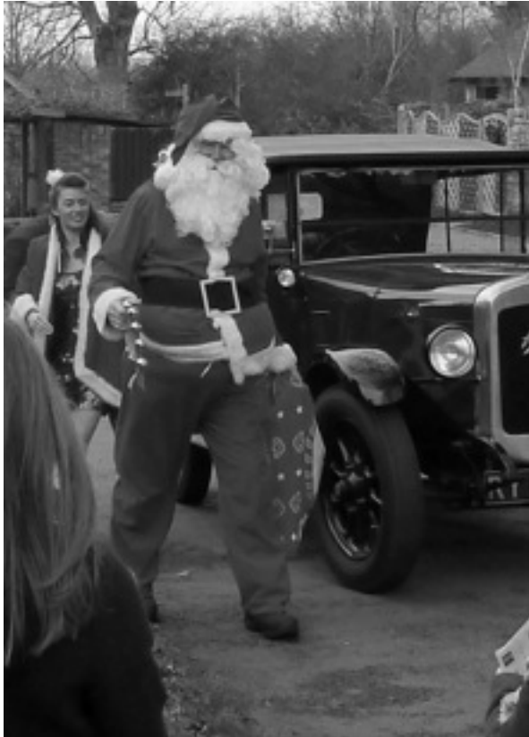
Father Christmas and his helper call in at the Fayre