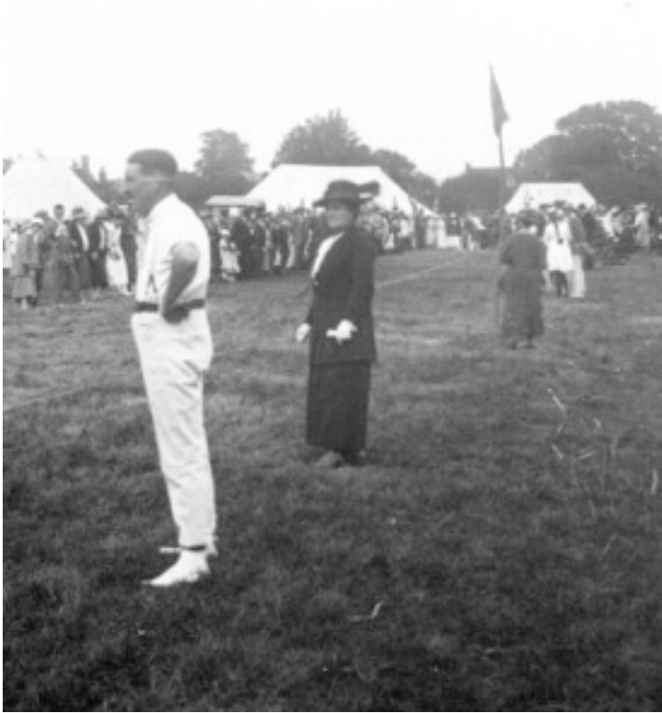
Watching the games at an earlier Fete on the School Field