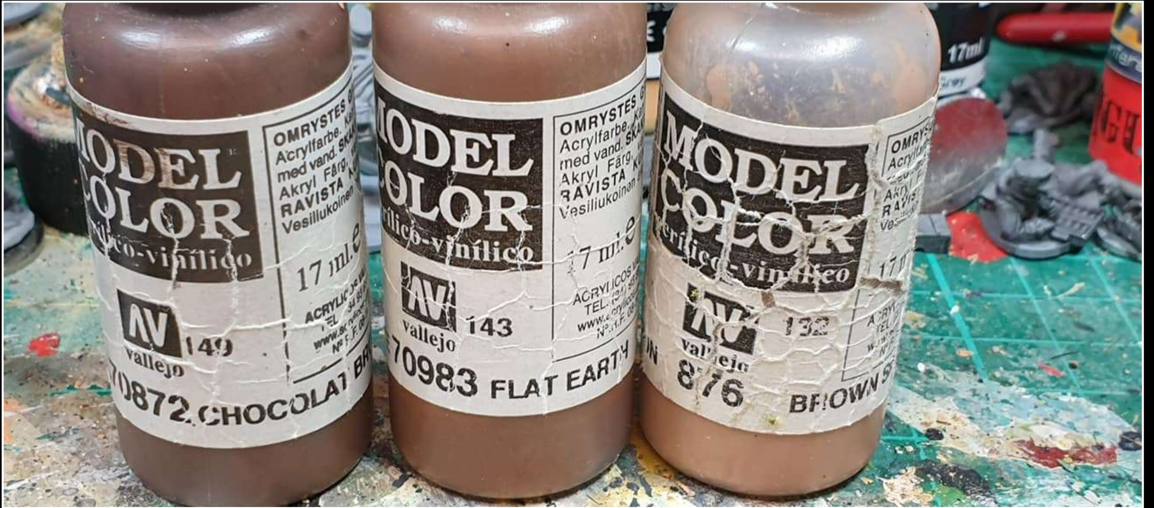
Alternative earthy brown suggestions