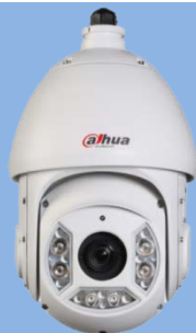
SD6C36E-H SD6C23E-H SD6C23C-H