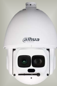
SD6AL230-HNI SD6AL240-HNI SD6AL230F-HNI