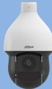
SD5936E-H SD5923E-H SD5923C-H