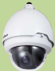
SD6336E-H SD6323E-H SD6323C-H