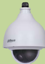
SD4023-H SD4223-H SD42C23-H