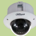
SD4023C-H SD4223C-H SD42C23C-H