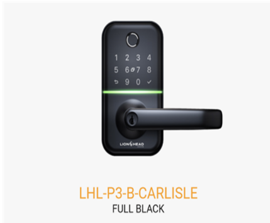
LHL-P3-B-CARLISLE FULL BLACK