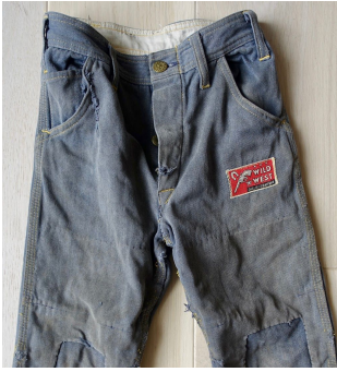
Your bag with spare change of clothes