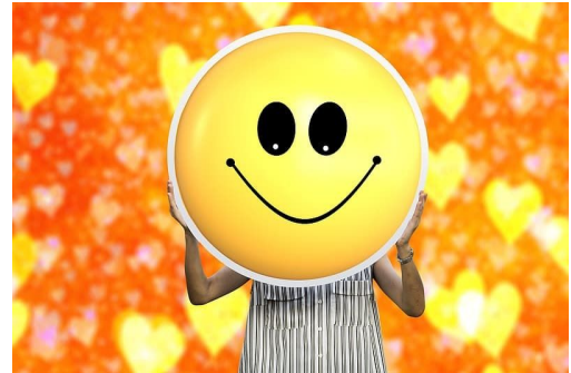
A big smile! Ready to play and learning