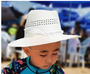
A hat for warm and cold weather