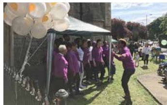
The Hackney Community Gospel Choir at the launch of the Fundraising Appeal

The St Mary's Centre will be a welcoming, useful, active focus for the whole of Stoke Newington, but we can only make this possible through the generosity of local people. People, we hope, like you.