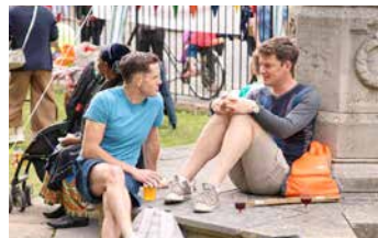
Launch of the Fundraising Appeal with a Pop-Up Food Market in the grounds of the church.

'Last week we had around 65 people visit the centre and we had to turn many away': Hackney Migrant Centre.