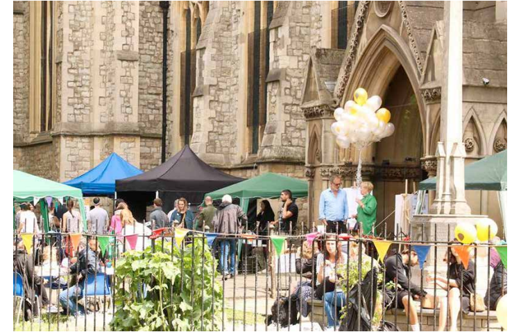
Launch of the Fundraising Appeal in the grounds of the church.

'Last week we had around 65 people visit the centre and we had to turn many away': Hackney Migrant Centre.