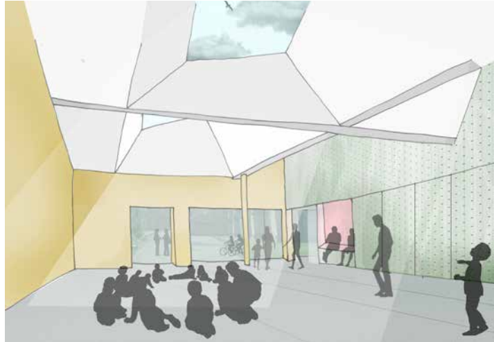
Visual of the hall