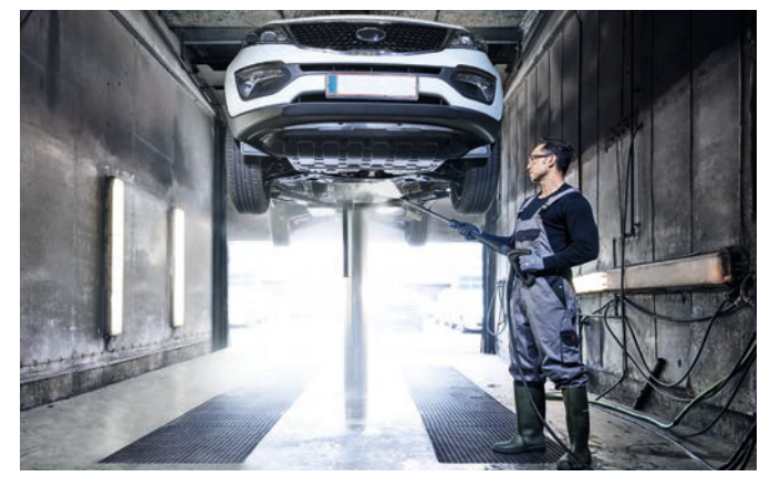
Hot Water Pressure Washers