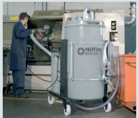
Machine tool maintenance in few seconds