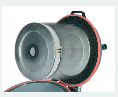
Filter for oil mists. It prevents particles of oil and water from becoming airborne