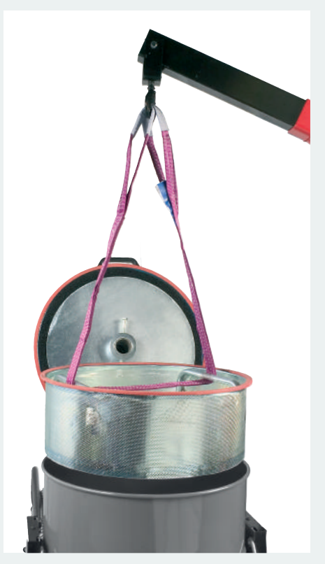
Belt for easy lifting and emptying