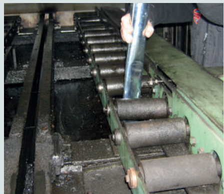
Vacuuming grinding sludge