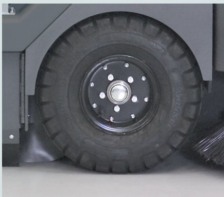
The large wheels give a smoother ride