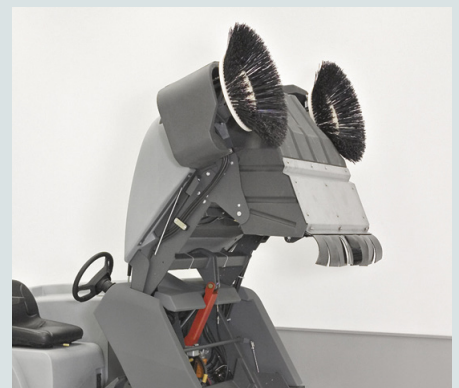
The SW8000 has a superb high-dump capability up to 152 cm from ground level for easy and convenient emptying