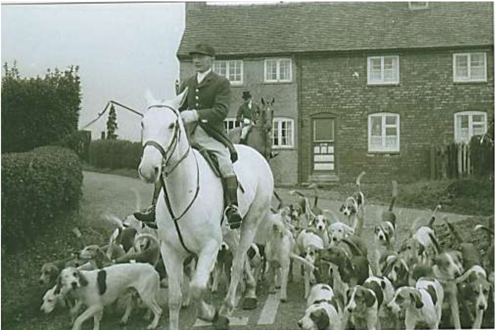
The Hunt at The Green (circa 1960) with Silver Cottage in the background.