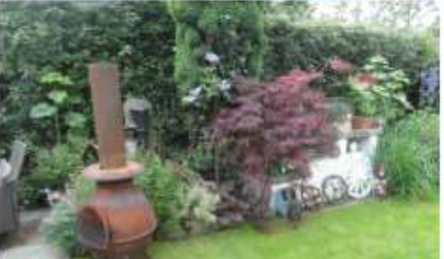
CHURCH DISPLAY and OPEN GARDENS WEEKEND