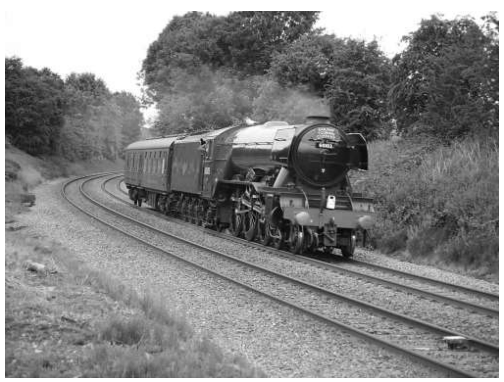
The Flying Scotsman passed along the local railway line on 18<sup>th</sup> June 2016 working from Crewe Heritage Centre to Newark it then went forward on a special from Newark to York.

SUMMER FETE AUGUST 20th 2pm at Bramshall Old Rectory Leigh Lane Bramshall Fun for all the family See you there!!