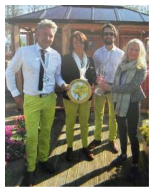
RHS Cardiff Spring Flower Show 2017 Best Tradestand Presentation.

Their Warrant of Appointment is a mark of recognition for the supply of goods and services to HRH The Prince of Wales for over a period of five years. Worldwide there are only around 800 Warrant holders. The appointment shows commitment to the highest standards of service, quality and excellence."