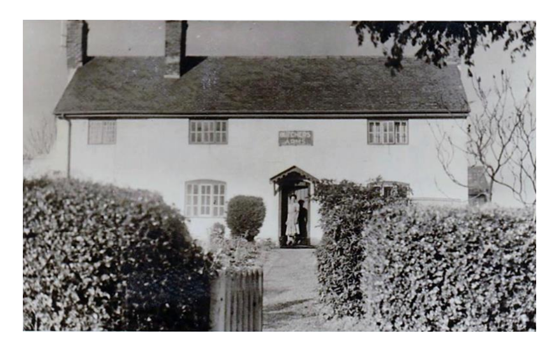
The Butchers Arms (now the Old Bramshall Inn) with landlady Penelope Farmer