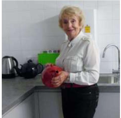
Helping hands in the new kitchen