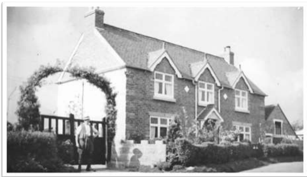
East View – this time circa 1950, with Bertie Whieldon