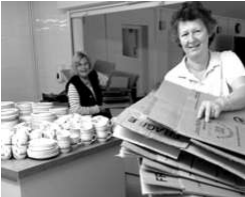
Unpacking the new kitchen

Also – following the revamp, we have discovered several odds and ends of crockery not belonging to the hall. If any of these items belong to you, please feel free to collect (arrange with SallyAnne on 565228).