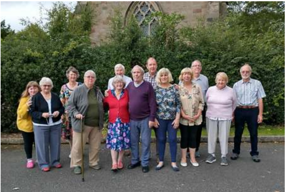
The Durose Family Gathering