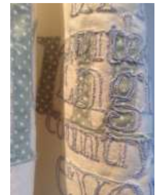
Stitch with the Embroiderers Guild April 2019