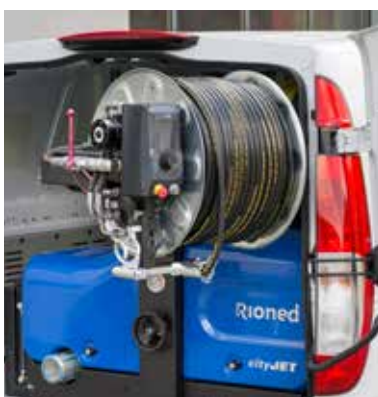
Wide 180° pivoting hose reel for max. 140 metres of 1/2" hose