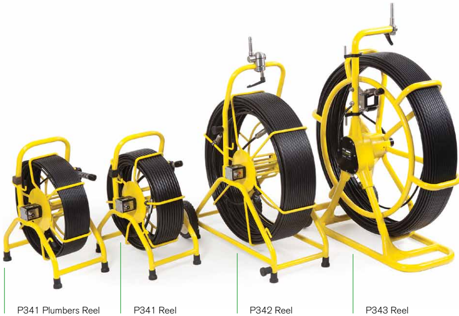
P341 Plumbers Reel