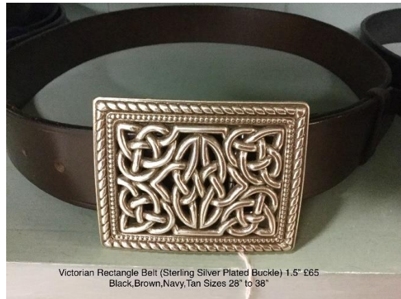
Victorian Rectangle Belt (Sterling Silver Plated Buckle) 1.5" £65 Black, Brown, Navy, Tan Sizes 28" to 38"