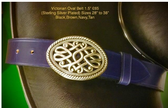
Victorian Oval Belt 1.5" £65 (Sterling Silver Plated) Sizes 28" to 38" Black, Brown, Navy, Tan