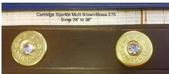
Cartridge Sparkle Multi Brown/Brass £75 Sizes 28" to 38"