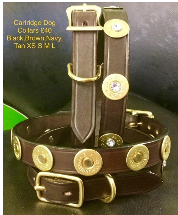
Cartridge Dog Collars £40 Black, Brown, Navy, Tan XS S M L