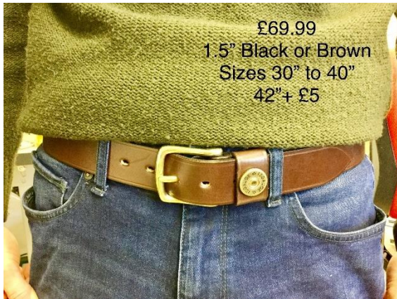
£69.99 1.5" Black or Brown Sizes 30" to 40" 42"+ £5