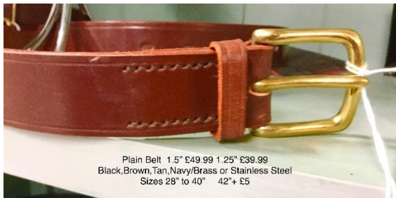
Plain Belt 1.5" £49.99 1.25" £39.99 Black, Brown, Tan, Navy, Brass or Stainless Steel Sizes 28" to 40" 42"+ £5