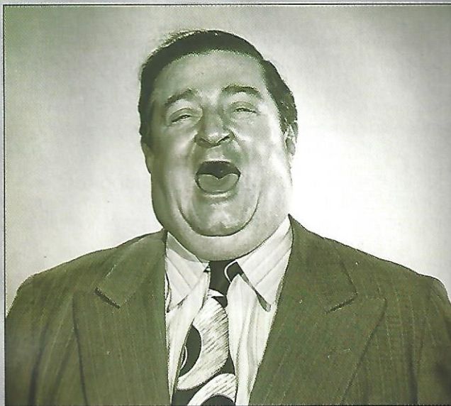
Lighten up – the way forward for salesfolk?