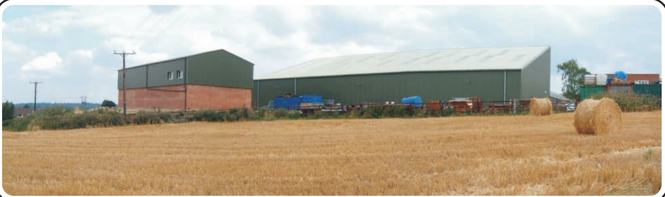
B Jubilee Mills.