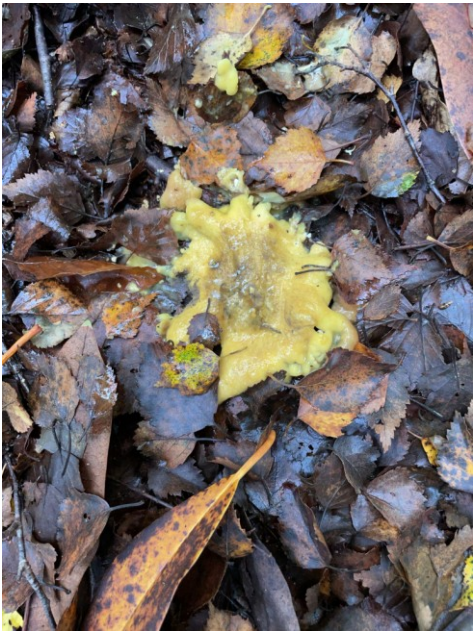
Golden Chantarelle, which looked like splatted egg!