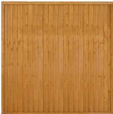
Close boarded Fencing

Indian sandstone paving - Randomly Laid 300 x 300mm, 600 x 300mm, 600 x 600mm, 600 x 900mm. Minimum fall of 1:100 from the dwellings