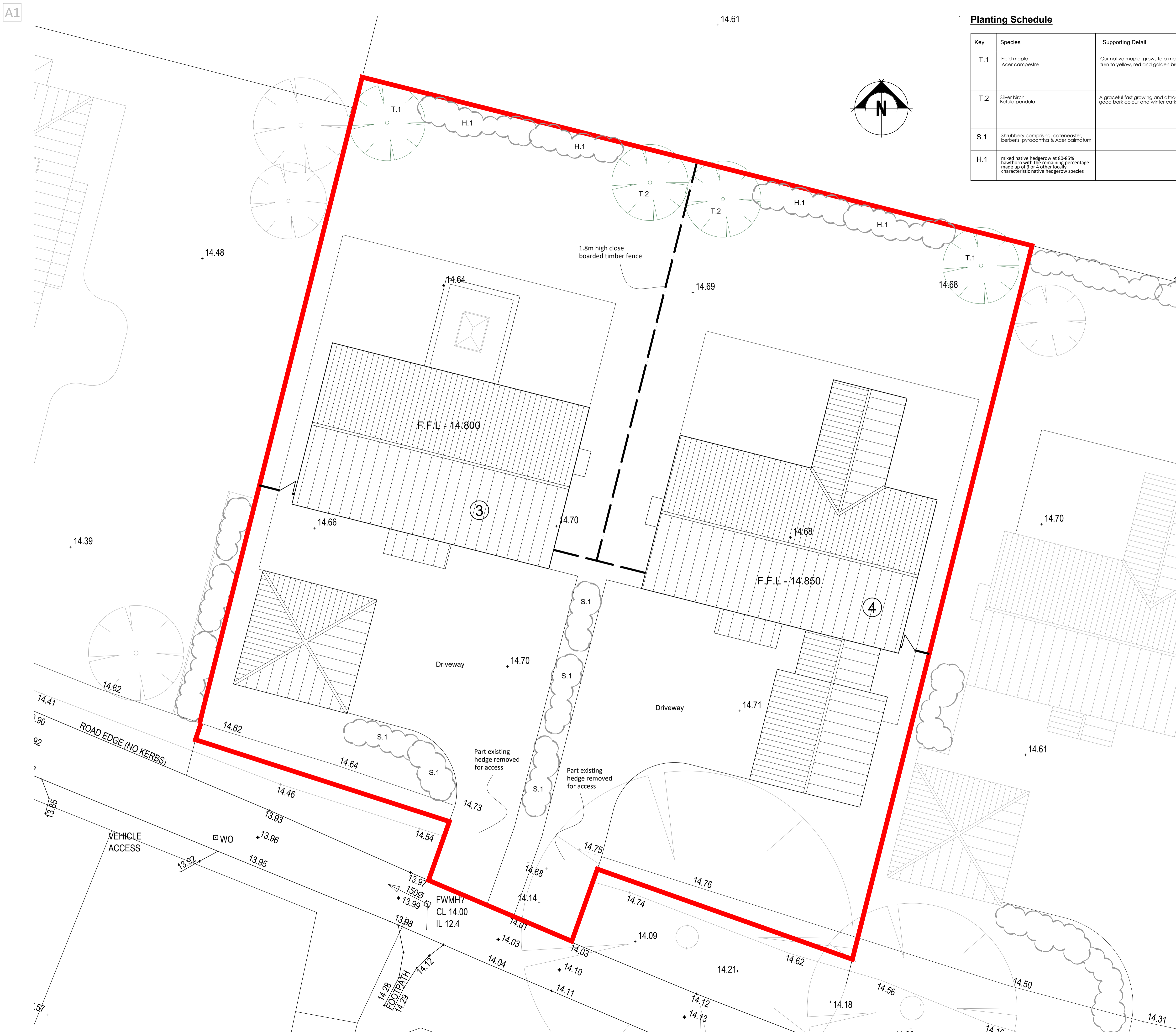
Proposed Site Layout Plan (1:100)