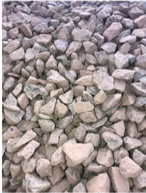
Pink 20mm Gravel (driveways)