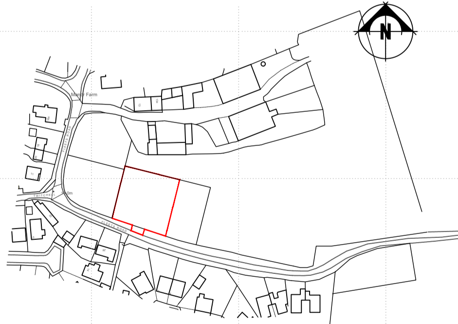
Site Location Plan (1:2500)

20mm pink gravel with sorrento block paved edging (please refer to separate details for tarmac crossover specification)