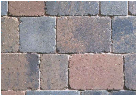
Sorrento Block Paving