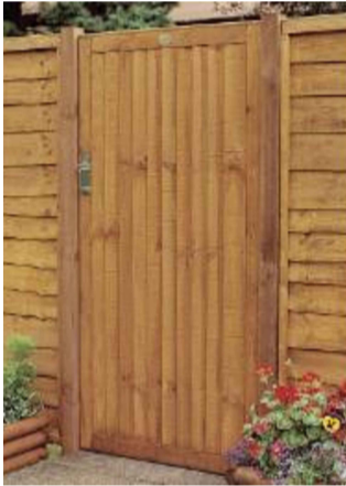
Solid timber gate