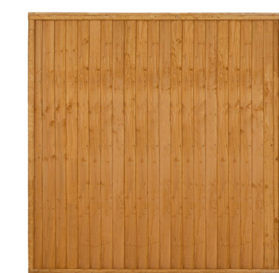
Close boarded Fencing