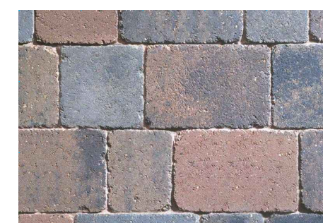
Sorrento Block Paving