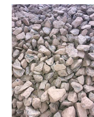
Pink 20mm Gravel (driveways)