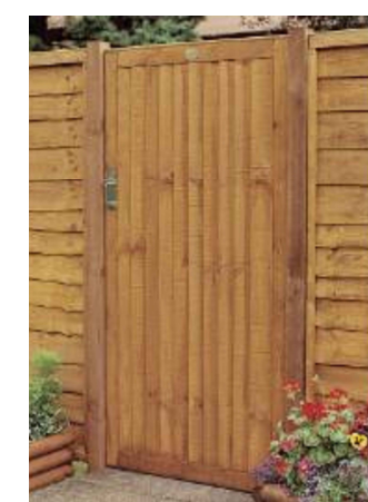
Solid timber gate