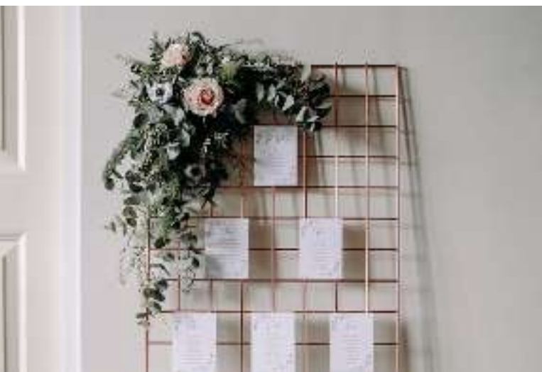
Table Plan & Styling

One of our favourite things to do is create stunning backdrops. Choose from our moongate, rustic arch, wooden hexagon, mesh backdrop or mesh moongate and then let us create something magical with flowers, foliage, and chiffon. Or why not choose from our flower or foliage walls or twinkle backdrop.