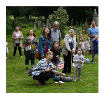
All eyes aloft