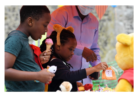
Choosing a parachute