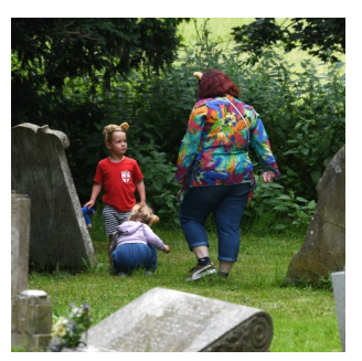
Looking for teddies