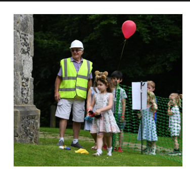
Waiting to pick up teddy