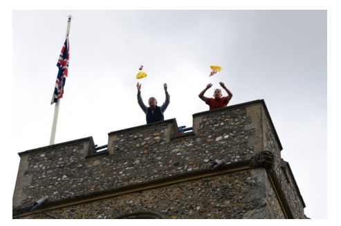
On their way down!