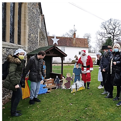
Hands On Day Care Centre meet Father Christmas