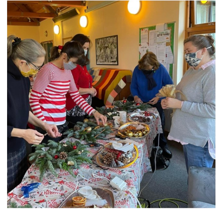
Christmas Wreath decoration