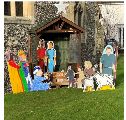
The Walk to Bethlehem