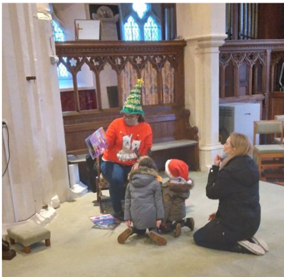
Storytelling with Ellen