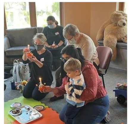
Coffee Pots & Tiny Tots make Christingles