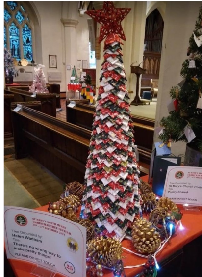
Visitors favourite tree by Abby Wadham