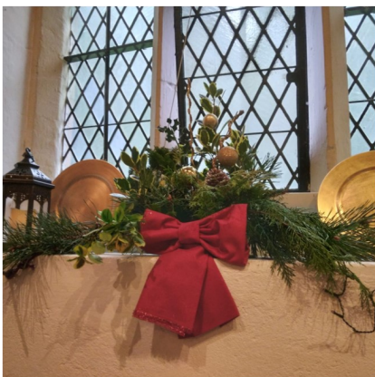
Beautifully decorated church