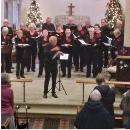
Carol concert with the Celebration Choir