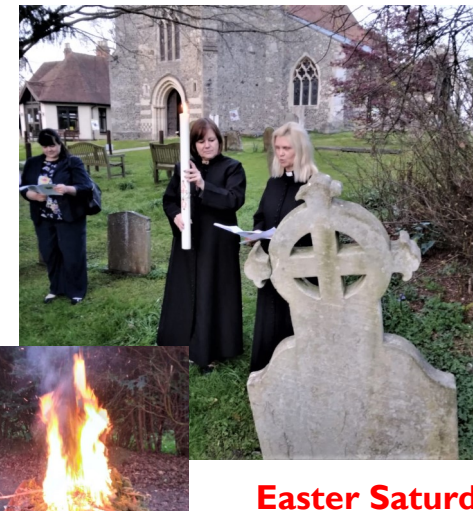
Easter Saturday Lighting the Pascal Candle from the fire