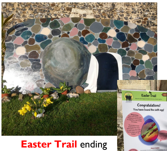
at the empty tomb