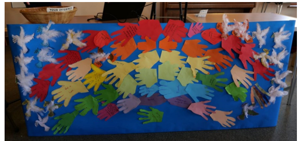
Noah's Ark—a rainbow of hands

Our Café Church starts from 9.30am in our Parish Room: St Michael's Room where we provide free tea, coffee and donuts or pastries, and there is lots of chatting, laughing and catching up on the week. The Service then begins at 10am with the songs we sing and the spoken responses projected onto a screen. The service style is informal and we use recordings of the songs to sing along to. This year we are exploring some of the great stories found in the Bible Old Testament, stories such as Creation, Noah's Ark, Moses in the Bullrushes and so on. There is plenty of congregation participation if you want to join in and the service often includes an activity which engages with our artistic skills.