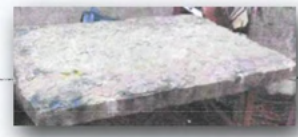
Stone Table in front of existing curved stone seating. (In memory of Miss Anne Preece).