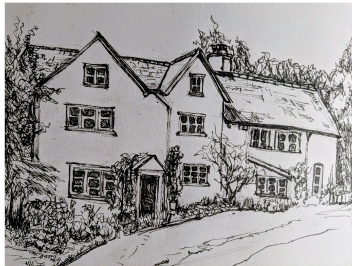
White House at Eaton Bishop

Gardeners' World May issue: 2-for-1 Gardens card and guide.