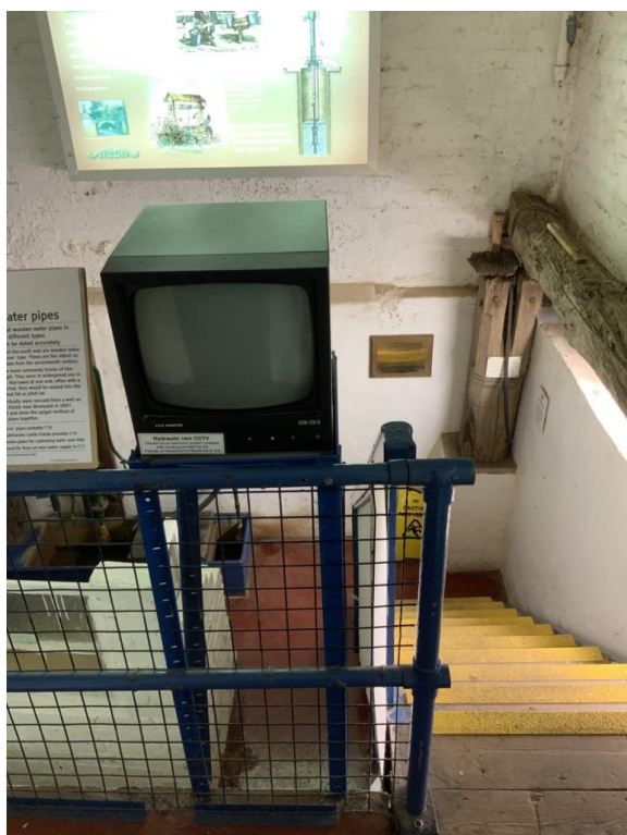
Some areas do not have step free access. The well can be viewed from above.