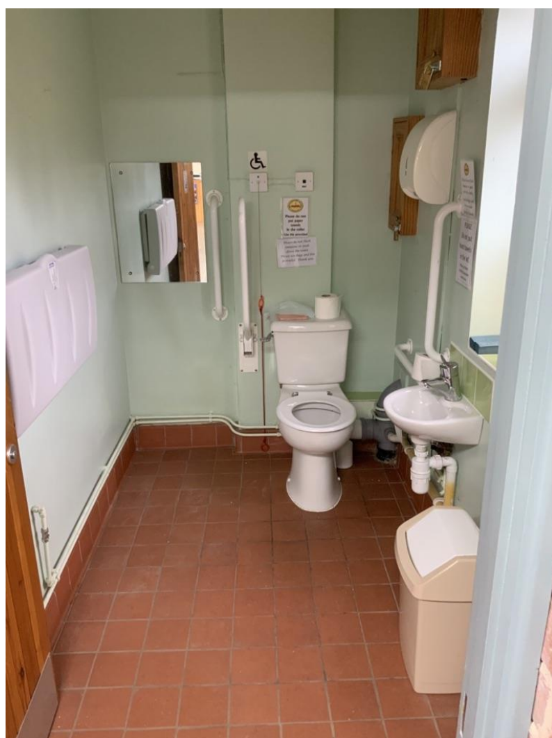
Picture of inside the accessible toilet.