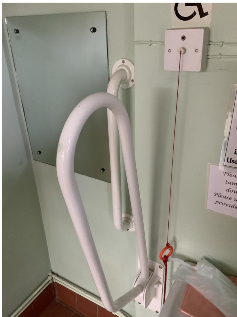
Grab rails are provided within the accessible toilet.