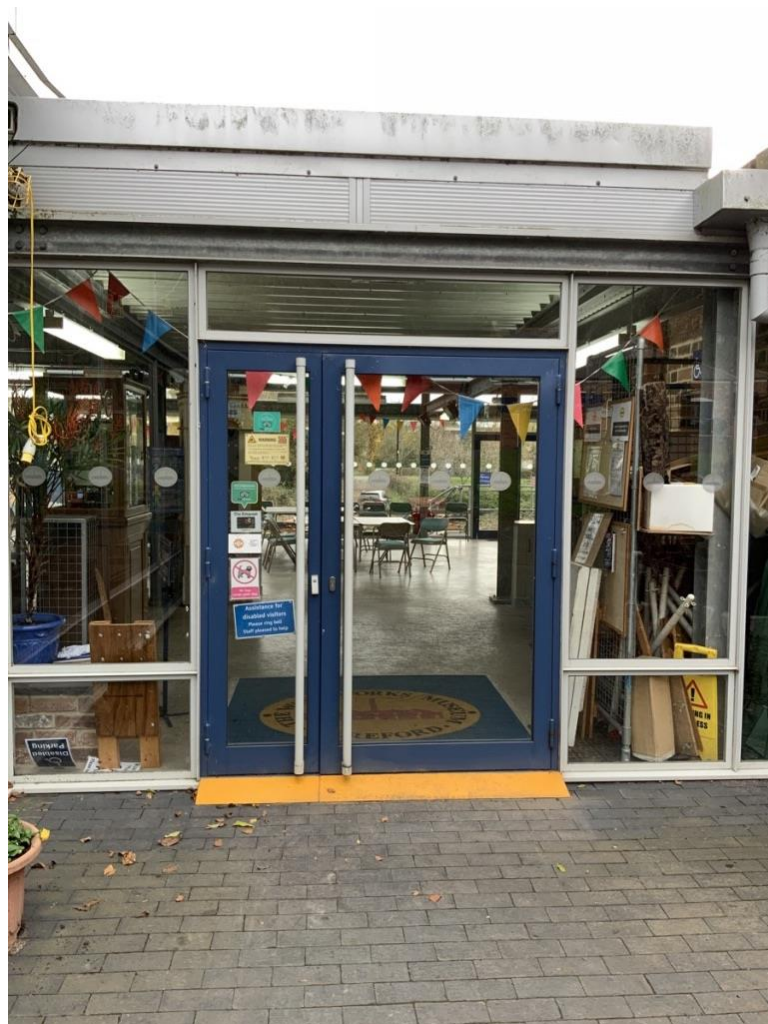
There is a level approach to the main entrance.