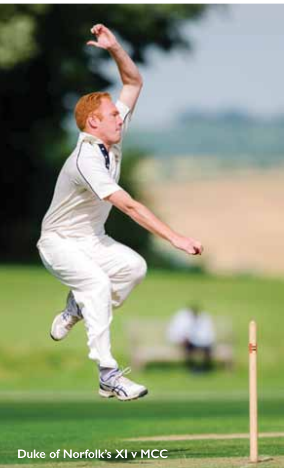
Duke of Norfolk's XI v MCC