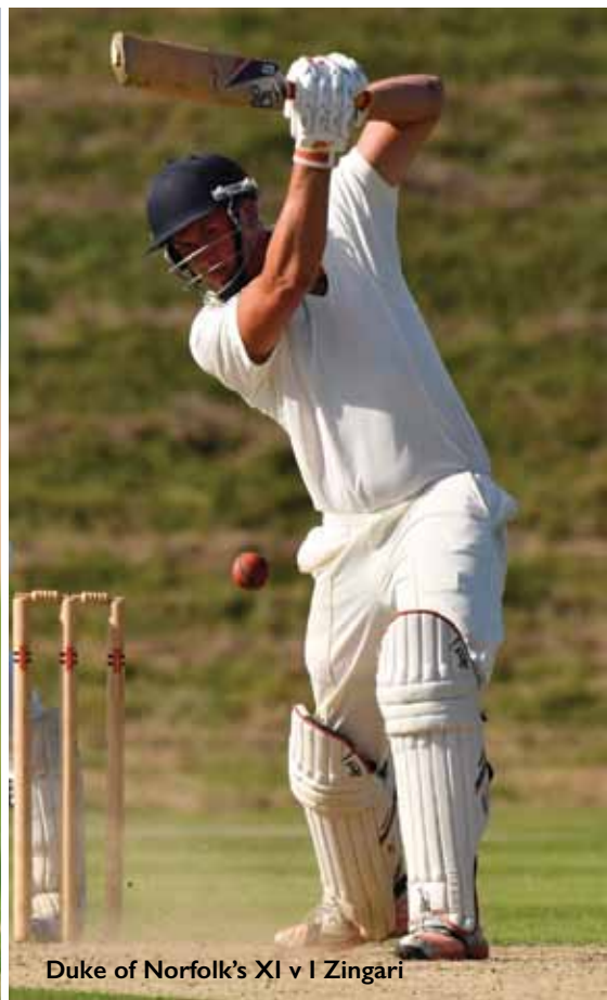
Duke of Norfolk's XI v I Zingari