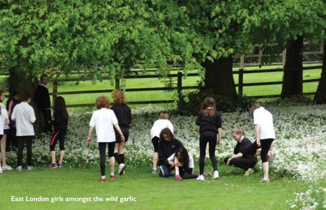
East London girls amongst the wild garlic