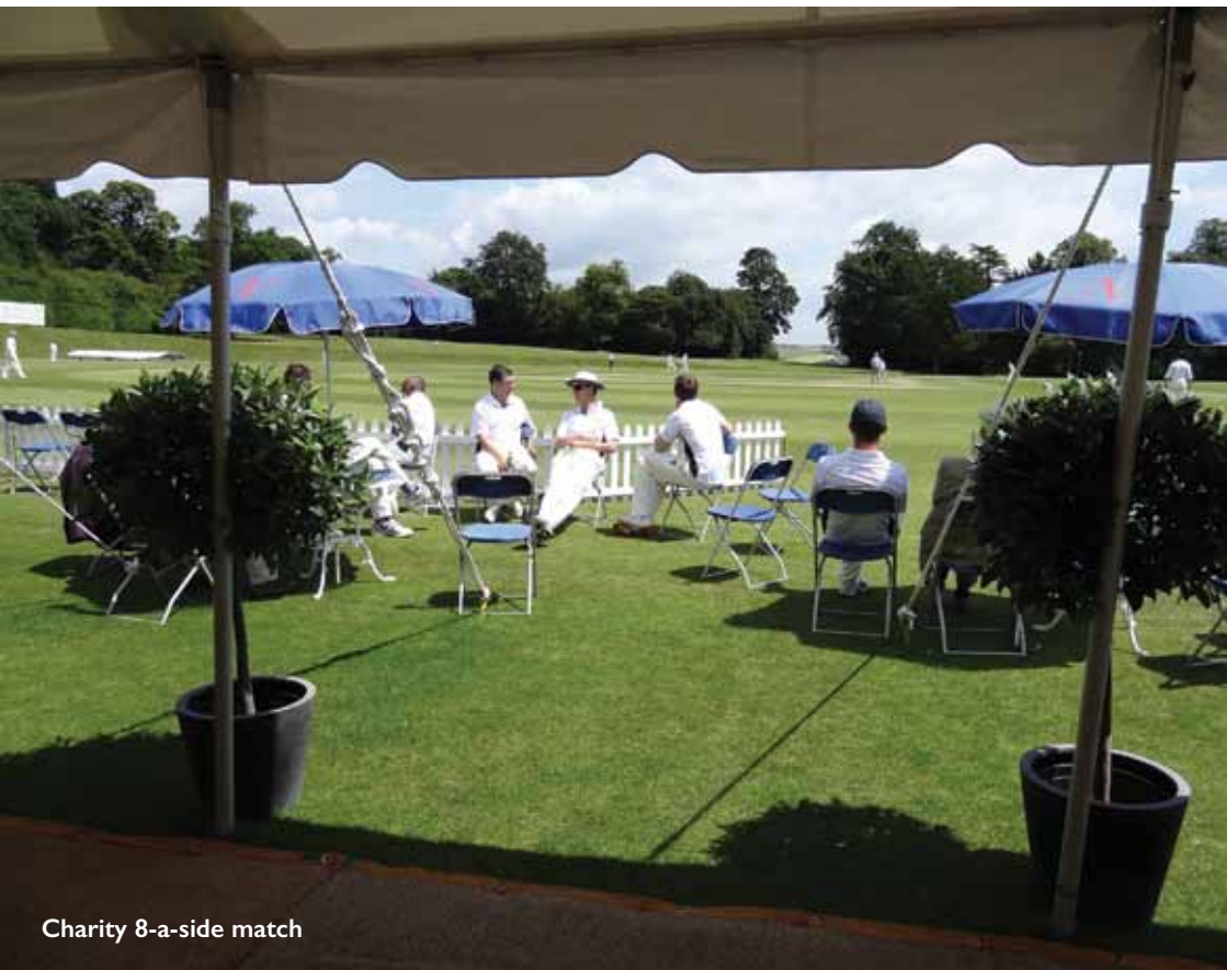
Charity 8-a-side match