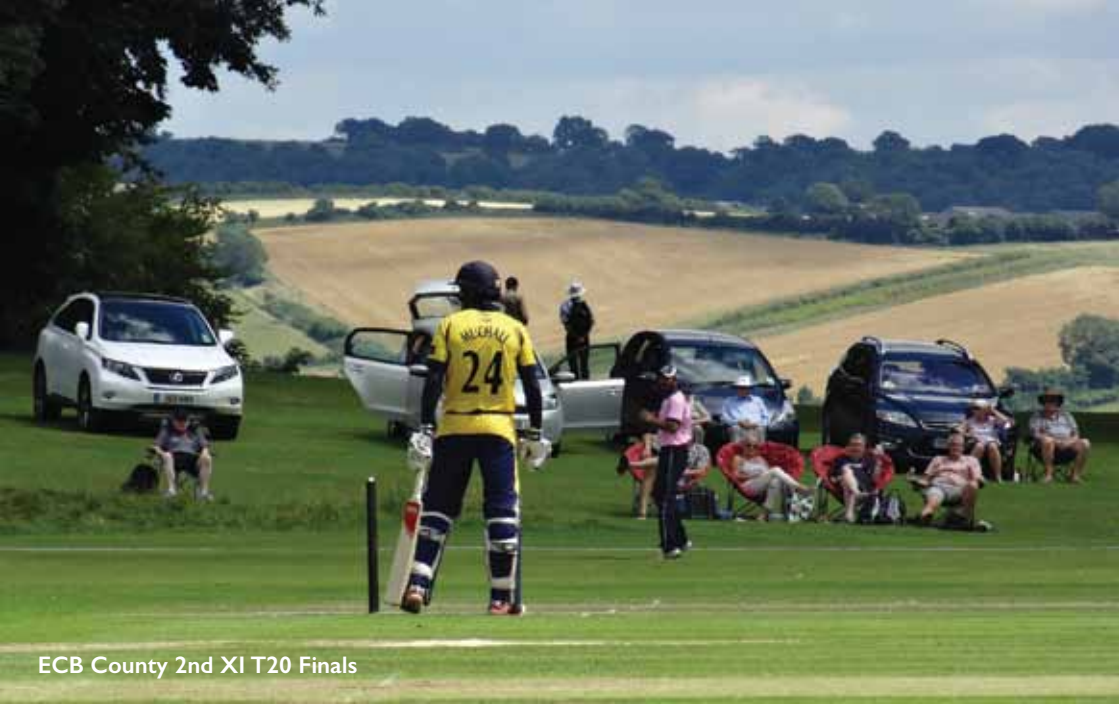
ECB County 2nd XI T20 Finals