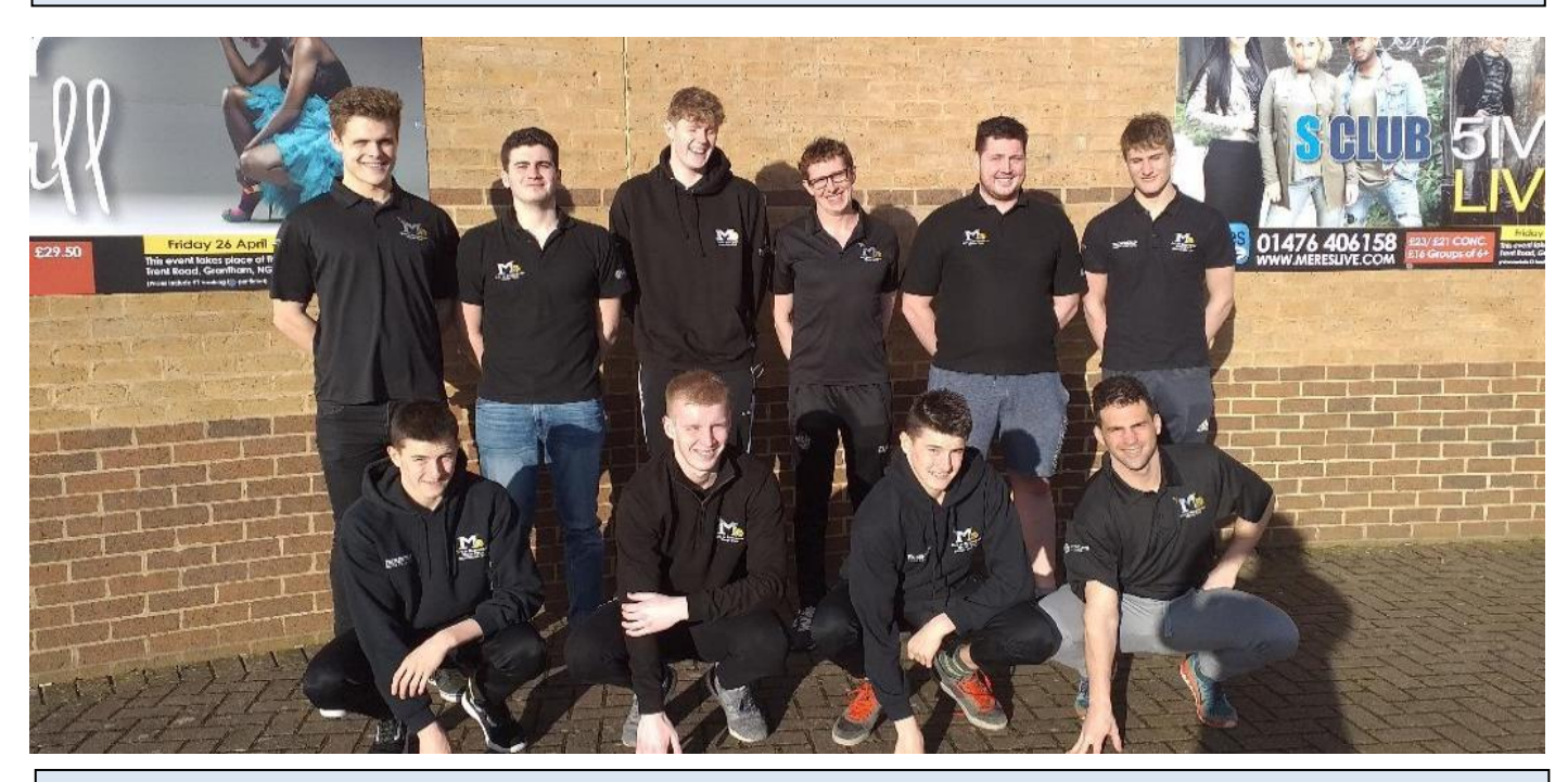
Photo shows the team members who played in the last matches of the season:

Despite this, the core fitness and skills of all players showed through in some sparkling team and individual performances, and much was achieved through grim determination and mutual support. The off-season will allow time to consolidate these attributes and plan a new campaign in 2019/20.